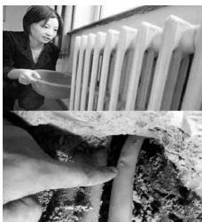
Heating Pipes/ Underfloor Heating Pipe Leaks