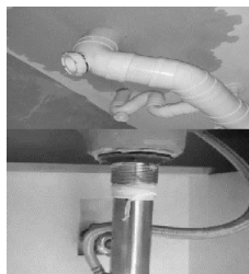
Water Supply Pipe Leakage/ Water Pipe Leakage