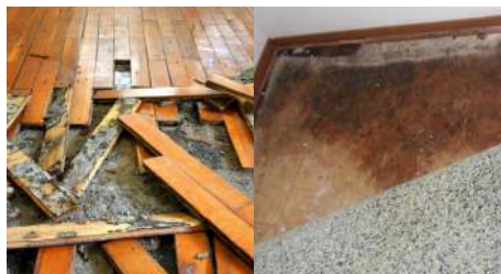
Leak Under The Floor