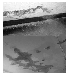
Roofs And Walls, Water Seepage In The Ground