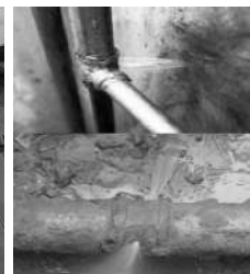
Fire Sprinkler System