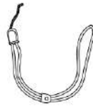
Wrist Strap (X1)